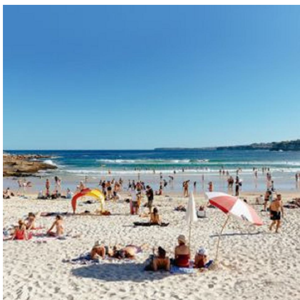
CITY BREAKS A former Vogue editor's guide to Sydney 10 OCT 2017