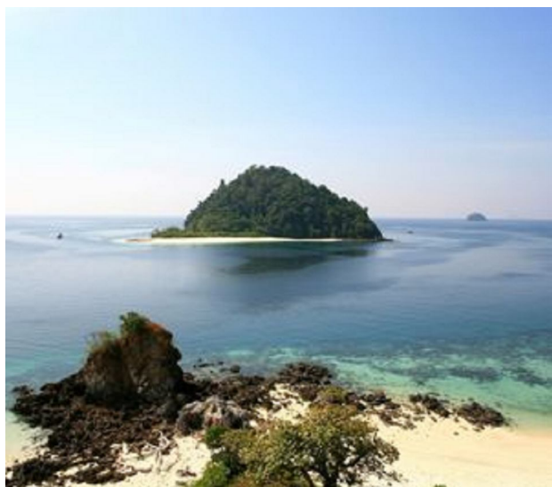
DI MART LUSIANA 28 JUL 2016