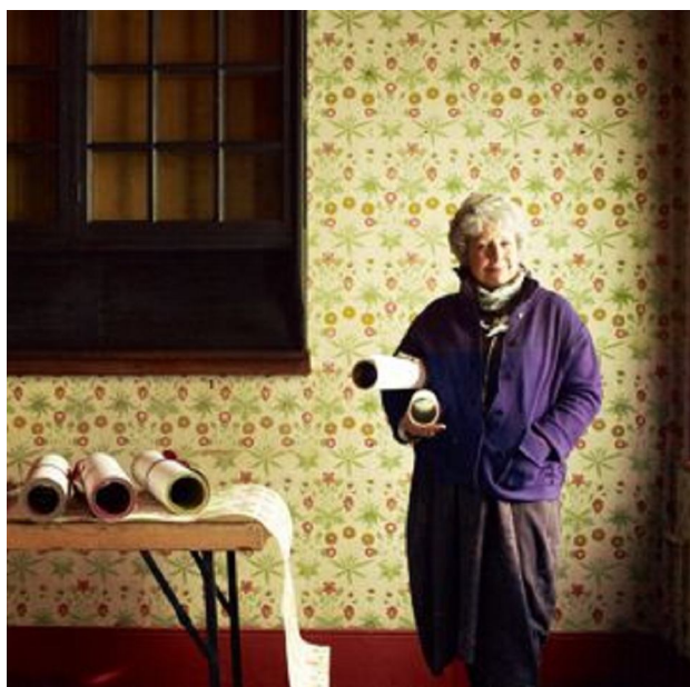
NEWS A jewel of the Arts & Crafts movement to reopen 09 MAR 2017